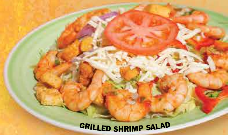
GRILLED SHRIMP SALAD

Chopped romaine lettuce topped with bell peppers, onion, tomato and shredded cheese 5.49