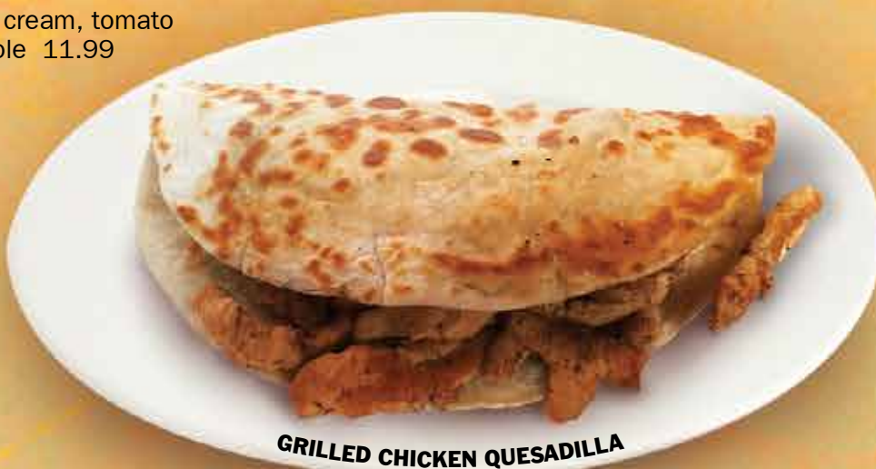
GRILLED CHICKEN QUESADILLA